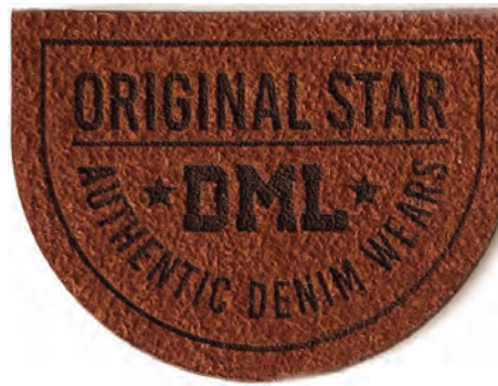
Laser Etched Suede Patch