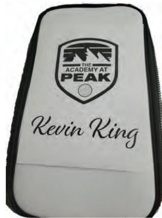
Golf Bag Pocket