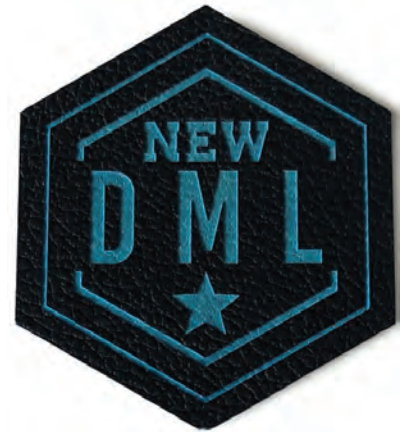
Unik Laser Etched Faux Leather