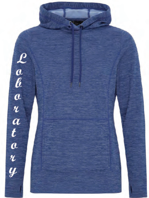
Cut Heat Press Vinyl