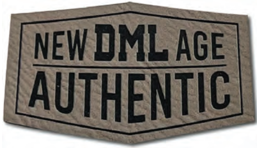
Laser Etched Faux Leather Patch