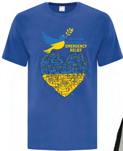
Printed Heat Press Vinyl