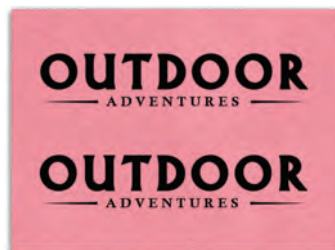
Laser Faux Leather